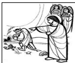
Temptation of Jesus (see also Mt 4.1-11; Lk 4.1-13)

12 And the Spirit immediately drove him out into the wilderness. 13 He was in the wilderness forty days, tempted by Satan; and he was with the wild beasts; and the angels waited on him. 14 Now after John was arrested, Jesus came to