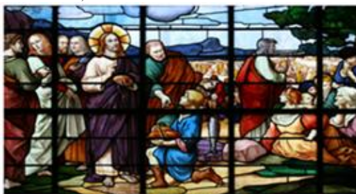
LET US ALLOW JESUS TO SATISFY OUR HUNGER

A reading from the holy Gospel according to John R. Alleluia, alleluia. A great prophet has risen in our midst. God has visited his people. R. Alleluia, alleluia.